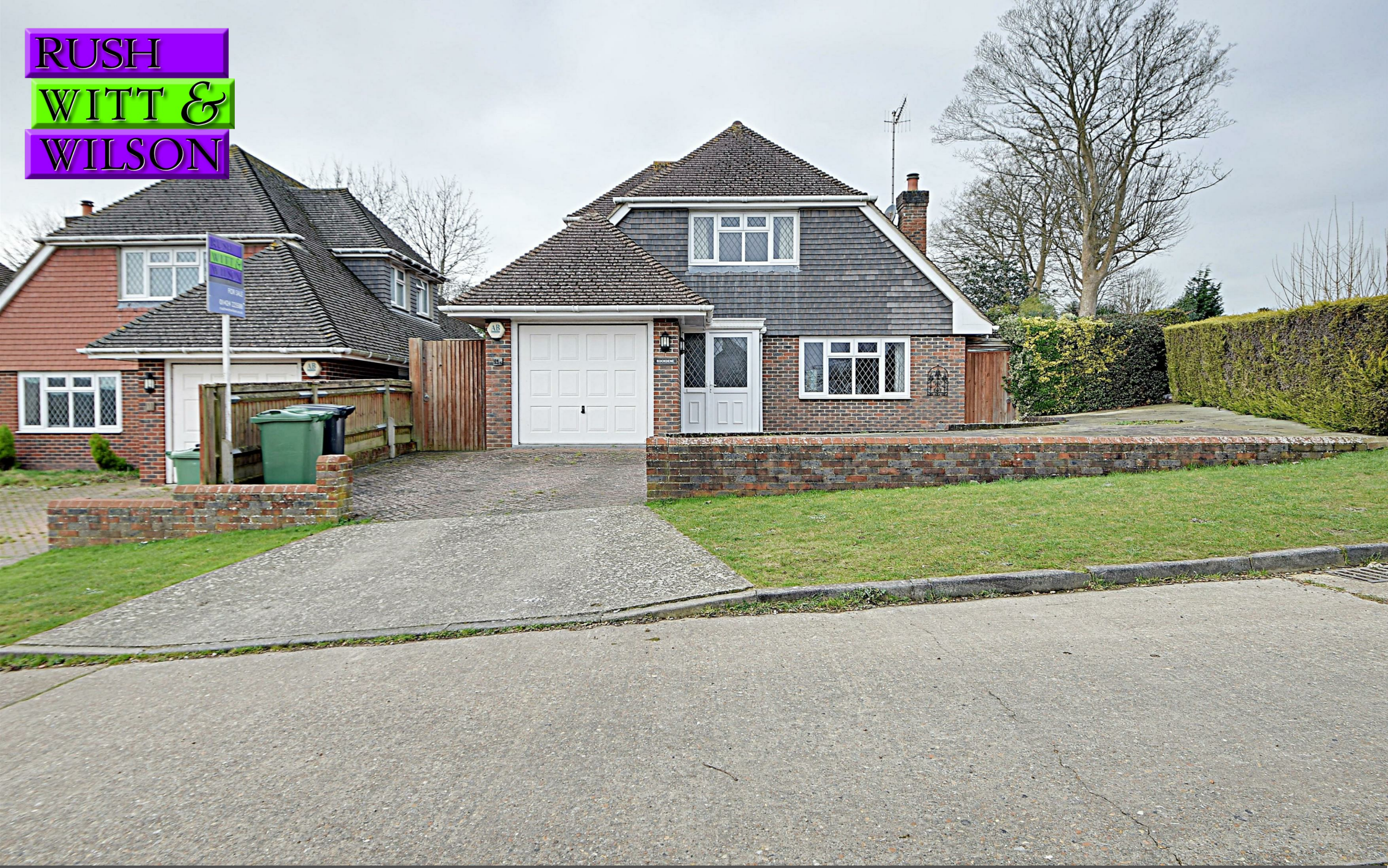
11A Old Farm Road, Bexhill-On-Sea, East Sussex TN39 4DN £449,950